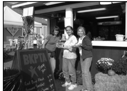
PTA members at the BKPTA Little Red School House booth at the fair.

Lastly, but certainly not least, thank you so much for your past support. We could not have done it without you! Together we can reach our goal and have this new playground up in no time!