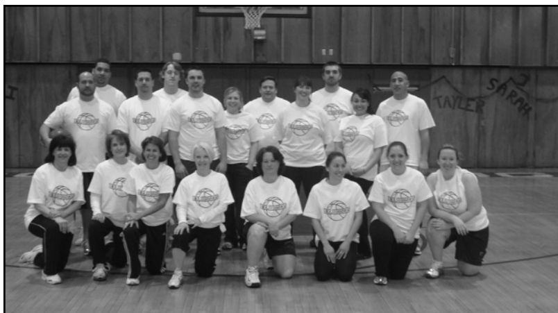
2010 BK Bruisers played the Harlem Wizards Sunday, February 28. Fun was had by all in attendance.

Our Chess Clubs has begun at both Brewster and Korn Schools. The kids have commented on how fun the game is and how "you really have to use strategy in this game". Rummikub Club will be forthcoming in April at Brewster School so be on the lookout for sign-ups. We would love to have some Korn students, who are familiar with the game, help teach. It would be a great